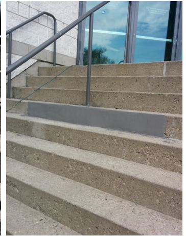
Cracks on stairs before repair.