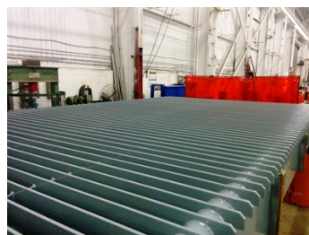
Application completed with Belzona 5811