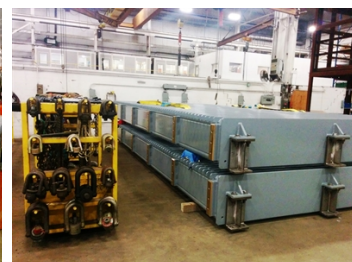
Application completed with Belzona 5811