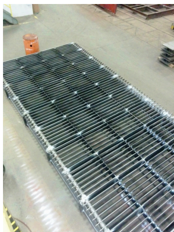
Control gate after surface preparation