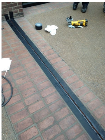
Application of Belzona 2211