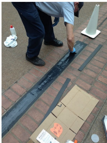
Application completed with Belzona 2211