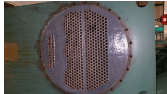
Rebuilding and protection of the tube sheet with Belzona 1121 and Belzona 1321.