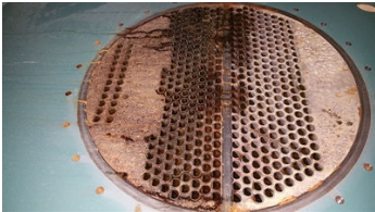
Tube sheet section damaged.