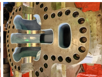
Final condition after inspection of the pump with Belzona 1111 and 2 coat system of Belzona 1341