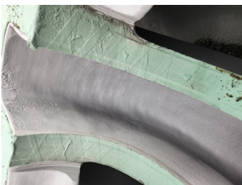
Pump after blasting, surface pitting is visible

Pumps work 24/7 to provide drinking water for residents; the 5 years of operations cause the pump to deteriorate, creating surface pitting and corrosion, so we recommended Belzona 1341 NSF grade to provide the necessary protection for the pump against the corrosion/erosion effects and at the same time drinking water grade approved. Customer is happy with the performance, as previous pumps stayed for 5 years.