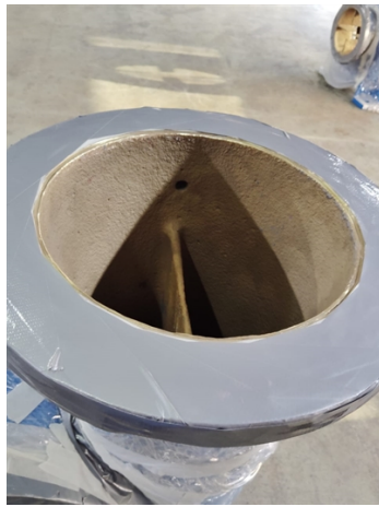
Surface was grit blasted to achieve the required profile.