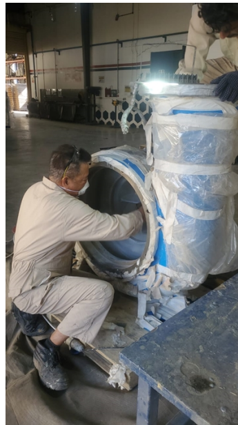
Application of Belzona 1121 for a strong, long-lasting restoration.