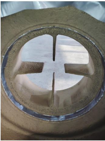
Severe corrosion and material loss in centrifugal pumps.

A power station customer is experiencing severe corrosion and material loss in their potable water centrifugal pumps, which are critical for water displacement circulation. This deterioration is driving up maintenance costs, reducing efficiency, and causing unexpected downtime. To restore performance and ensure long-term reliability, the customer requires a durable solution to mitigate corrosion and extend the equipment's service life.