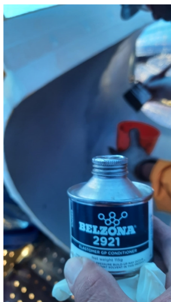
Belzona 2921 Surface Conditioner Application

The bonding of the previously installed neoprene rubber sheet failed. Traces of corrosion dripping out in between the rubber sheet and the clamp were observed after a few months of installation.