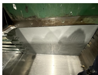
Side view of application.