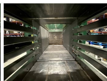
Both sides after application.