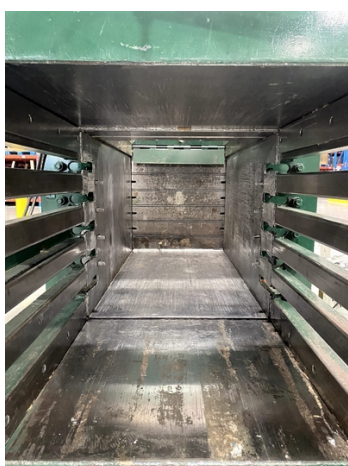
Baler lining after power tool cleaning before application of Belzona 1121.

The lining of the baler was experiencing wear due to ramming of the loader. Plates could not be welded to both sides due to the thickness requirements. Belzona was consulted, we gave various options and customer picked that of rebuilding with a paste grade product.