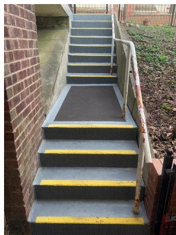
Stairs after application