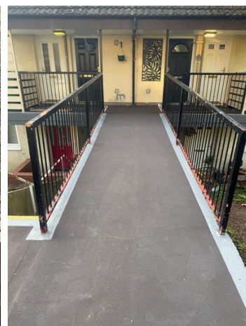
Stairs after application