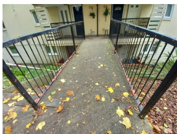
Balcony before application

After being approached on a safety issue, Belzona were asked to supply a solution to make good spalled concrete areas and provide a safe walkway to a number of flats in the Nottingham area