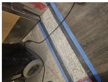
Removal of tripping hazard and surface preparation.