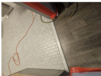
Existing transition from room to bathroom.

An uncomfortable step was creating serious problems on the transition from rooms to bathrooms at a healthcare facility. The patients were tripping at a serious pace. Belzona came to the rescue.