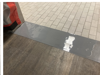
Belzona 4411 applied as topcoat.