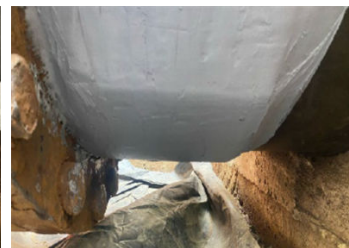
The entire area is wrapped with Belzona 1111 and Belzona 9341