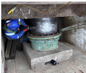
Surface area was prepared to minimum surface profile using power tools