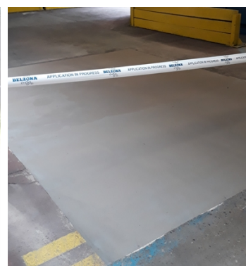
Area completely screeded at an average of 6mm using Belzona 4911 TX Conditioner and Belzona 4131 MagmaScreed