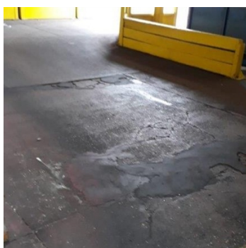
Main entrance for all forklift traffic into 4.6 hectare warehouse

The area had been "repaired" using other methods a number of times, none of which created a durable solution