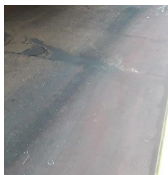
Damage caused by constant heavy solid wheel handling machinery