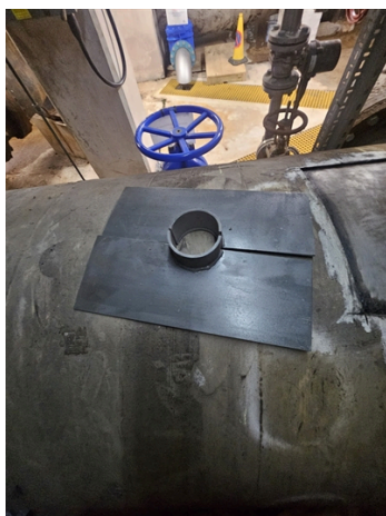
Cold applied plate bonding was selected as the long-term protection solution