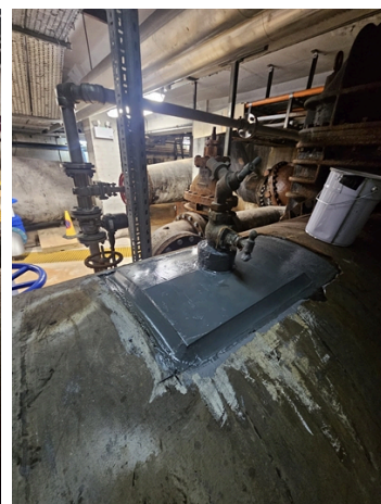
Belzona 1111 was filleted, presenting a smooth finish and completing the long term protection solution