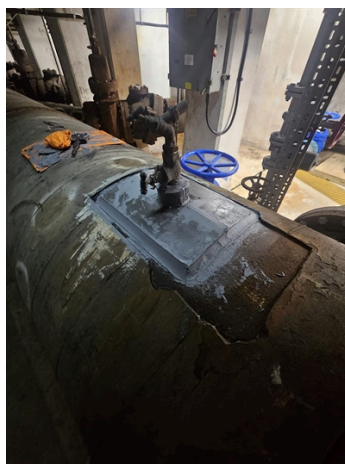
The pre-fabricated plate was fitted around the nozzle and loaded with Belzona 1111