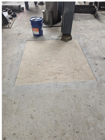
Damaged section rebuilt using Belzona 4124.