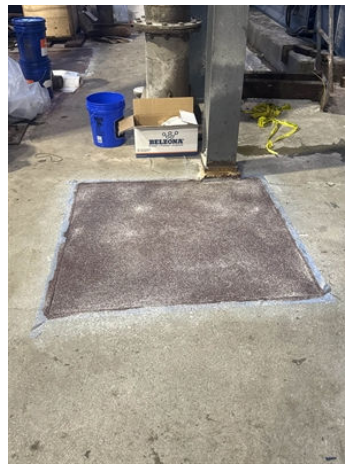
Rebuilt section after one coat of Belzona 5811 and coat of Belzona 4311. Both were broadcasted with aggregate to rejection.