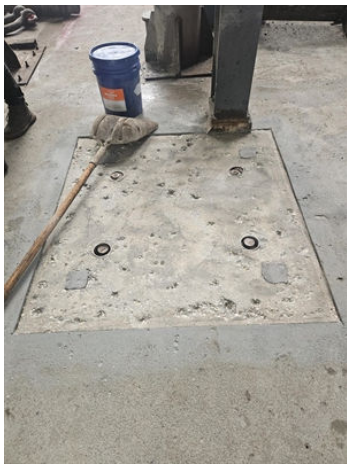
Damaged section after surface preparation was completed.

As part of the maintenance schedule, equipment was removed from the floor decks. In addition, sugar fluids have deteriorated the coating applied in the past. The customer required rebuilding and coating all these spot during 4th of July weekend.