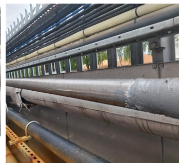
Demo repair complete