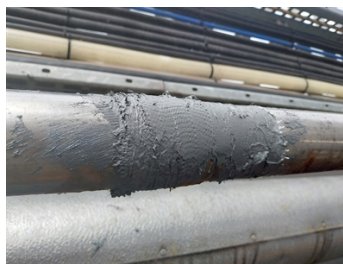
A repair effected by Belzona 1212 and Belzona 9341