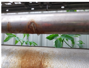
Showing one of many leaks to the main Ferric pipe range

A pipe run of some 20m has numerous leaks. The engineers are looking for a solution by repairing the pipe, rather than replacing it. A replacement will be carried out at some point, but the repair is a better option for them at this time