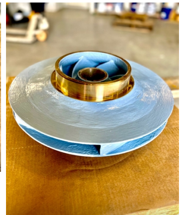
Completed repair of brass impeller using Belzona 1111 and Belzona 1321