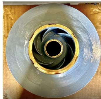
Top view of the repair using Belzona 1111 and brass plate