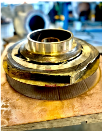
Before Belzona repair and protective coating

The customer was facing shutdown in their facility due to not having a backup impeller and long lead time for a new impeller.