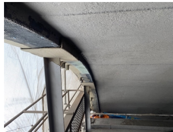
Steel was bonded to the top of the tank to provide more stability.