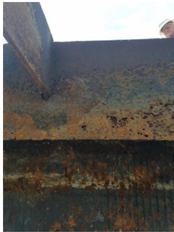
An example of the damage corrosion caused here.