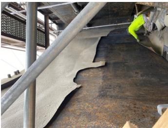
Previous coating was failing

The Customer thought this clarifier tanks days were over. They submitted a permit for a new one and was told the permitting process would take five years so they started looking for a different solution. The previous coating they had installed came off in sheets and the corrosion under it had caused severe damage to the tank.