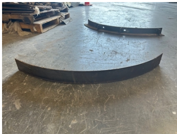
New upper and lower braces at customer location.

Customer was having high erosion on the braces supporting a ball mill handling Barite. Due to the high velocity and operating temperature of 300F, the Barite powder in the air was degrading the braces to no use within 2-3 months.