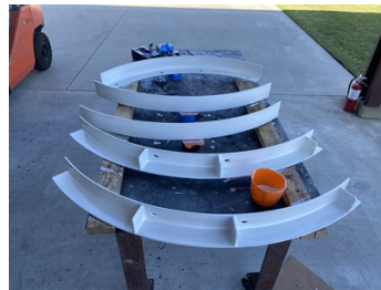
First coat of Belzona 1331 applied.