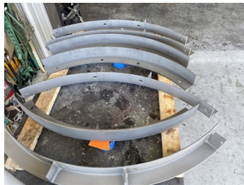
Braces blasted and prepped for application at Belzona/AAS location.