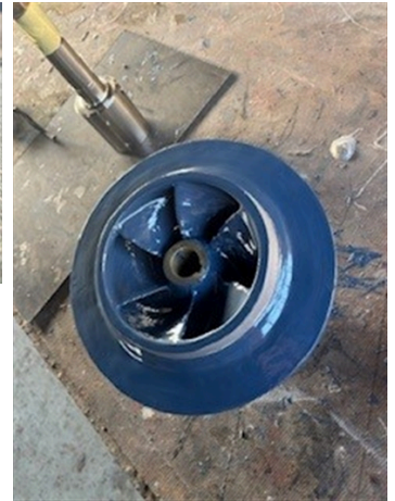
Impeller Completed And Restored.