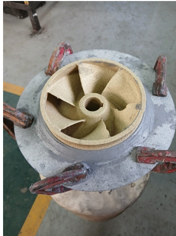
Stainless Plates Cold bonded, Clamped And Shaped To Rebuild Lost Areas.