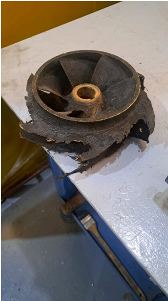
Damaged Impeller Received From Customer.

Customer had an emergency docking and sourcing a new impeller would have taken 6 to 8 weeks delivery. Impeller was severely eroded and required urgent rebuilding and coating protection from salt water as this was the vessel's sea water cooling pump.