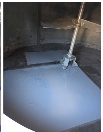
Before images, with markings to identify application area