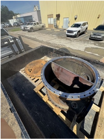
When the channel head was delivered

Corroded and pitted channel head, divider plate and end cover