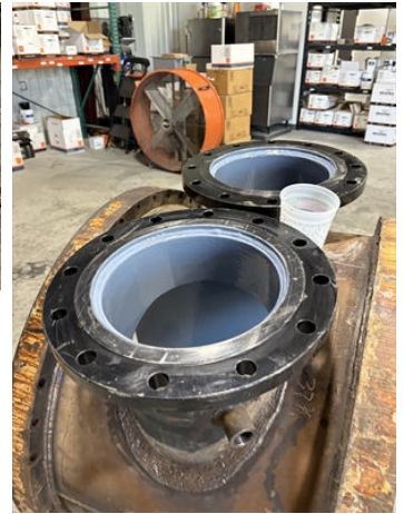
Top of Channel head