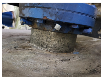
After surface preparation