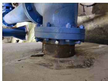
Before surface preparation.

Ground water clarifier nozzle and parts on the tank close to it were leaking and required stemming the leak and repairing the eroded parts.