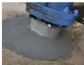
After application of Belzona 1161