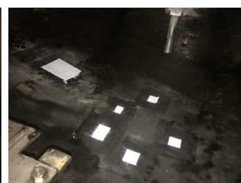
Remedials in November 2020 with Belzona 1593.