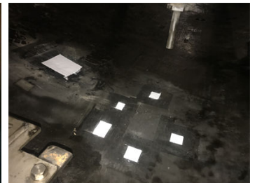
Remedials in November 2020 with Belzona 1593.