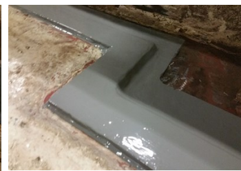
Repair overcoated with Belzona 5831 for corrosion protection