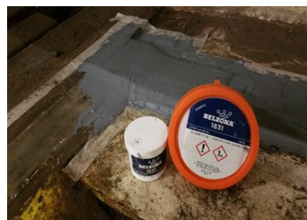
Belzona 1161 used to rebuild the damaged area