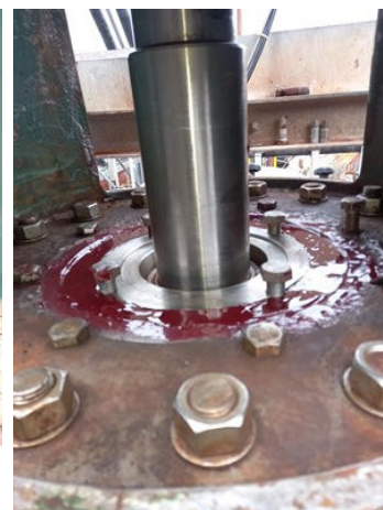
Belzona 4331 filled to replace the lost metal