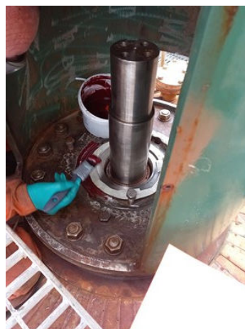
Area prepared & wetted out with Belzona 4331