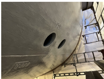
initial condition of ship

The original glass flake coat had broken after a few years in service. This leaves the ship unprotected and vulnerable to corrosion.