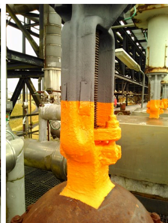
Area taped out