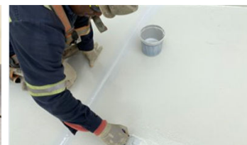
Final coat being applied.