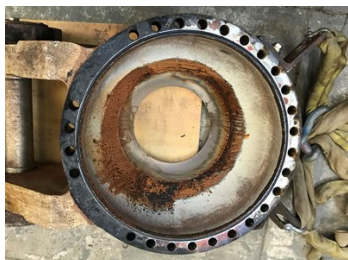
Before / Damage on the Nozzle head

Cavitation damage on the substrate due to high pressure on the nozzle head