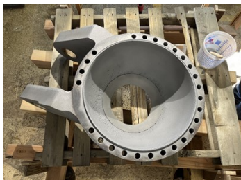
After abrasive blasting to SSPC SP-10/3 mil profile Surface Preparation