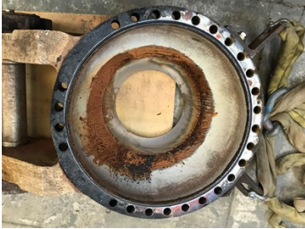
Before / Damage on the Nozzle head

Cavitation damage on the substrate due due to high pressure on the nozzle head