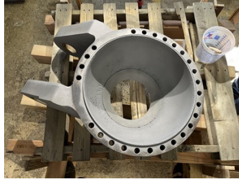
After abrasive blasting to SSPC SP-10/3 mil profile Surface Preparation