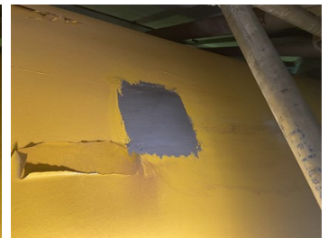
Area reinforced with Belzona 1212/9341 Mesh