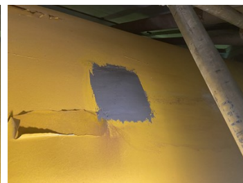
Area reinforced with Belzona 1212/9341 Mesh