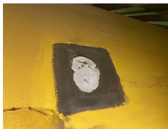
Leak stopped with Belzona 9611