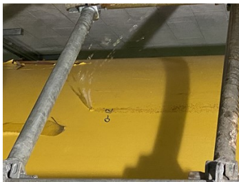
Leak as found

Leak developed in dissolving tank due to corrosion because of liner failure.