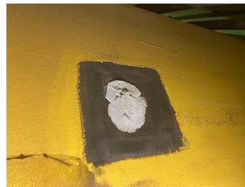
Leak stopped with Belzona 9611