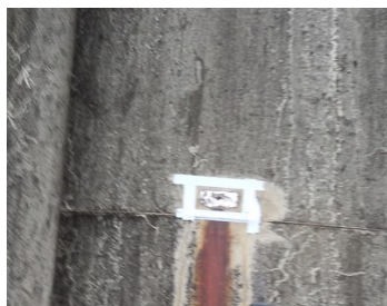
Initial surface preparation