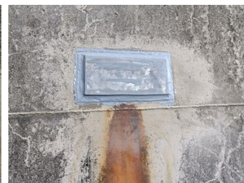
Plate bonded in place with Belzona 1161