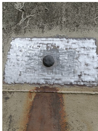
Leak sealed with Belzona 9611 & additional surface preparation carried out