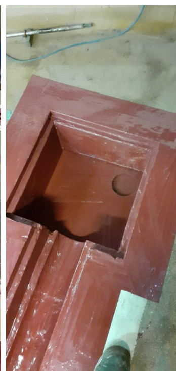
Completed 4181 concrete repairs and 4331 coating