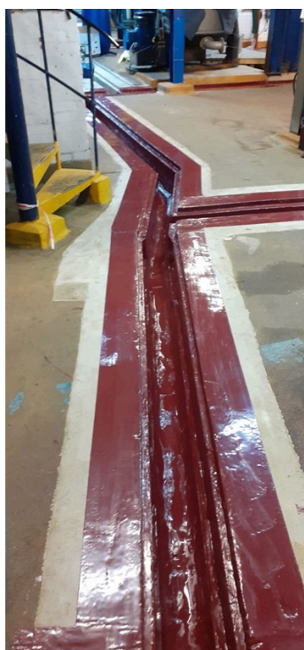
Completed 4181 concrete repairs and 4331 coating