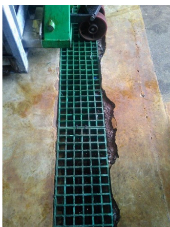
Loose grates and crack shoulders, requiring rebuilding using 4181

Concerns were that the chemicals were escaping into the ground through damaged drains, causing serious environmental concerns