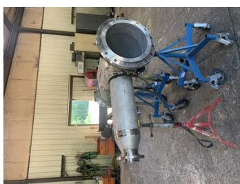
Pipe spool with interior pipes blasted to attain proper surface preparation.

The pipe spool is in an area where 90% Sulfuric Acid is injected into their system, and there have been problems with chemical corrosion inside the pipe spools especially at the weld seams. The customer has tried different types of pipes and protective coatings, but nothing worked. They would have to replace this section with a new pipe spool every three to six months. The customer had used Belzona 4301 Magma CR1 Hi-Build in another area of the plant, and Belzona 4301 had worked great in that area. We decided to apply Belzona 4301 to the interior of the new pipe spool.