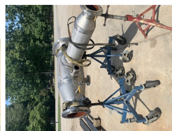
Finished product curing in the South Carolina August Sun.