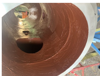
Interior of pipe spool with Belzona 4301 applied.