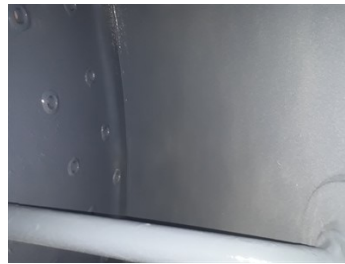
Initial coat of Belzona 1321 being applied