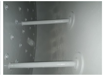
Application completed and protected tank inner surfaces