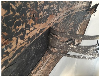
Delaminations on the original rubber lining