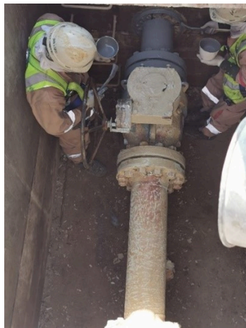
Application in progress