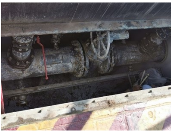
Original condition of the corroded pipeline

The facility manager responsible for the airport's infrastructure found problems related to the jet fuel pipeline. Corrosion has been detected, posing a significant risk to the safety and reliability of the pipeline.