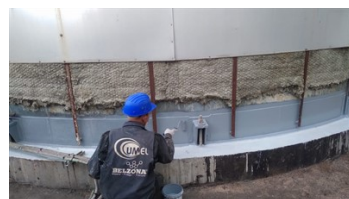
Application du Belzona 5811 to protect the plate bond against the environment.