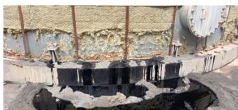
Live hydrocarbon leak.

The bottom of a hydrocarbon storage tank had corroded over time, leading to a continuous leak between the tank and its base.