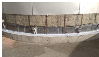
Plate bond reinforcement on the lower part of the tank.