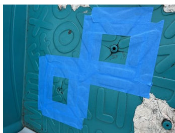
Preparation of the application area