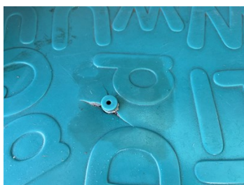
Blow holes with cracks formed around it

Together, we explored a few alternative solutions that might work, albeit without guarantees. Given the limited availability of other options, we mutually agreed that attempting one of these alternatives would be a sensible course of action. This collaborative approach demonstrates our commitment to finding the most appropriate solution for our customers, even when faced with complex and unique challenges.