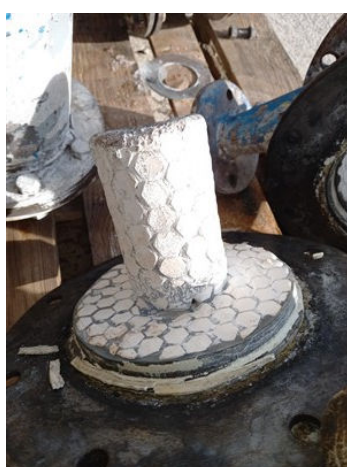
Current system after 6-years of service.