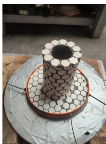
During the repair procedure.