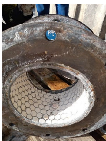
Current system after 6-years of service.

Two hydrocyclones were subjected to strong abrasion combined with a chemical attack (Milk of Lime; [Ca(OH)_2] ). After 6-years of operation, a refurbishment was necessary.