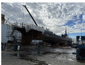
USS Bowfin on dry dock being refurbished.

The USS Bowfin a Historical WWII Submarine had been situated in the Pearl Harbor Submarine Museum and Park since it was retired in 1971. After 20 years in the water since last dry dock visit it was finally brought back to dry dock for refurbishment. There was extensive and deep pitting of the submarine's hull down the waterline and had to be fixed/repaired during the dry dock refurbishment.