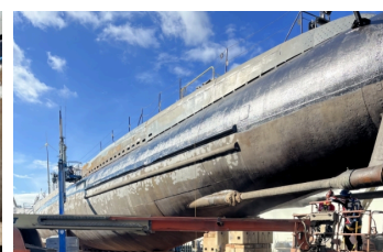
The hull of the submarine being painted over after the Belzona 1121 was fully applied and cured. Application finished.