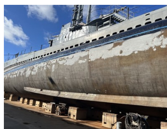
All of the pitted area filled with Belzona 1121 around the hull of the submarine.