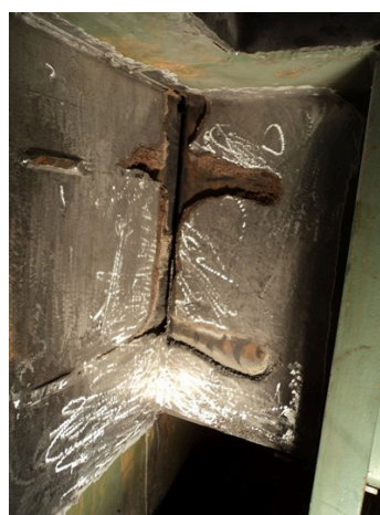
Cleaned substrate before product application