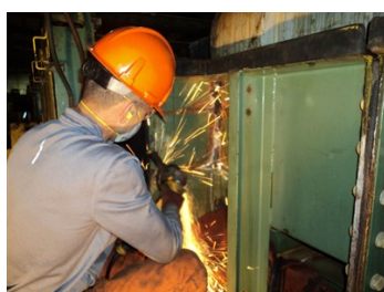
Surface preparation with a grinder to bare metal