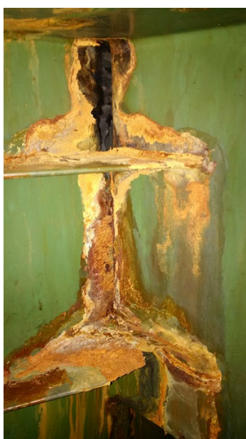
The substrate chemically attacked from the acid

Hydrochloric acid tank in a Pickle line was suffering from chemical attack and developed a leak. They needed a product that had excellent chemical resistance against Hydrochloric acid at high concentrations to stop this leak and protect the outside of the tank.