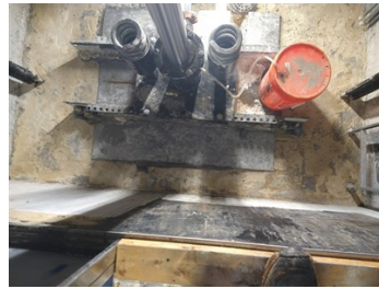
Application in progress