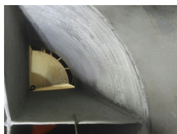
Belzona 1111 used to repair and rebuild the valve's body.