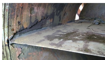
Damages to the valve's body.

A Howell Bunger Free Discharge valve is commonly used for handling high flow rates from dams and reservoirs. The valve was inspected identifying severe corrosion, erosion, and wall thickness loss of the internal flow dividing walls; specifically at the fixed cone, valve's body, and shutter.