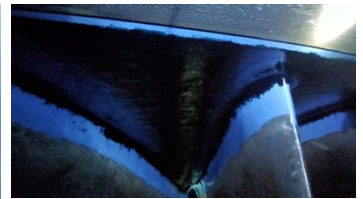
the image of affected impeller