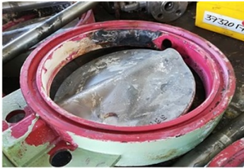
View of valve damage.

The sealing rubber was broken, which causes water to come into direct contact, eroding the substrate where the seal is made.