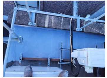
Fully encapsulated in a short time with little difficulty