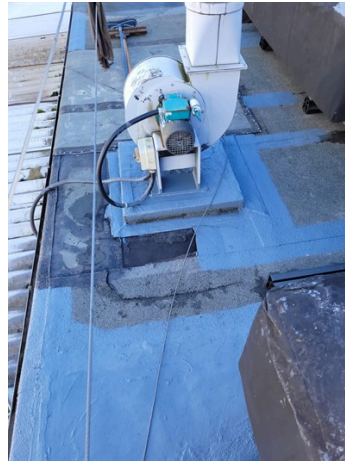
Geometric challenges overcome using Belzona 3000 series