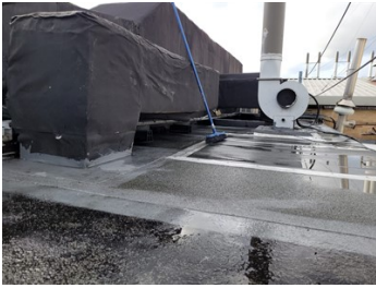
Bolted assets and standing water

A leaking roof over an engineering workshop proved troublesome and challenging for conventional repair methods, due to the services, ducting, cable troughs and other assets attached.