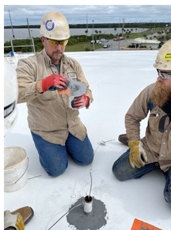
1121 being applied to the piece that will be bonded.