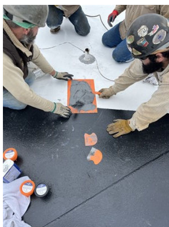
1121 product being mixed.