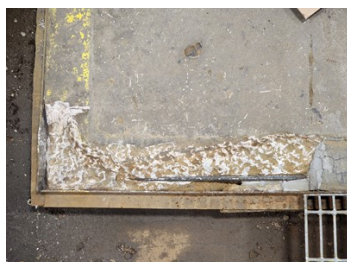
All loose material removed and the surface prepared with a hand grinder on both the concrete surfaces and metal surfaces.