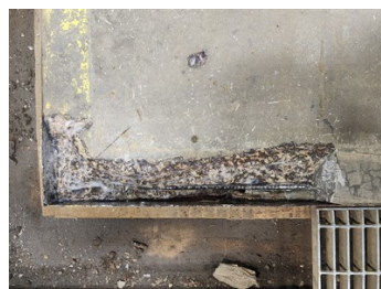
Belzona 4911 Conditioner applied liberally.