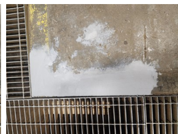
Belzona 4111 application completed.