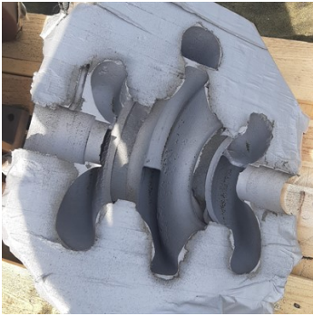
Grit blasted casing

The customer noticed small cavities in the casing due to pitting corrosion during inspection and were concerned about the life of the equipment as this could lead to failure.