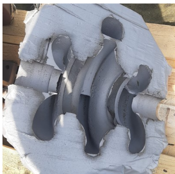
Grit blasted casing

The customer noticed small cavities in the casing due to pitting corrosion during inspection and were concerned about the life of the equipment as this could lead to failure.