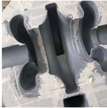
Pit filling and rebuilding application prior to coating