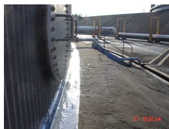
Belzona 3131 applied