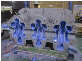
Split casing pump repaired and protected with Belzona